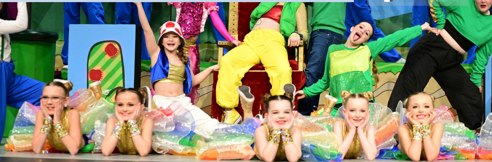
Dance Program 2024