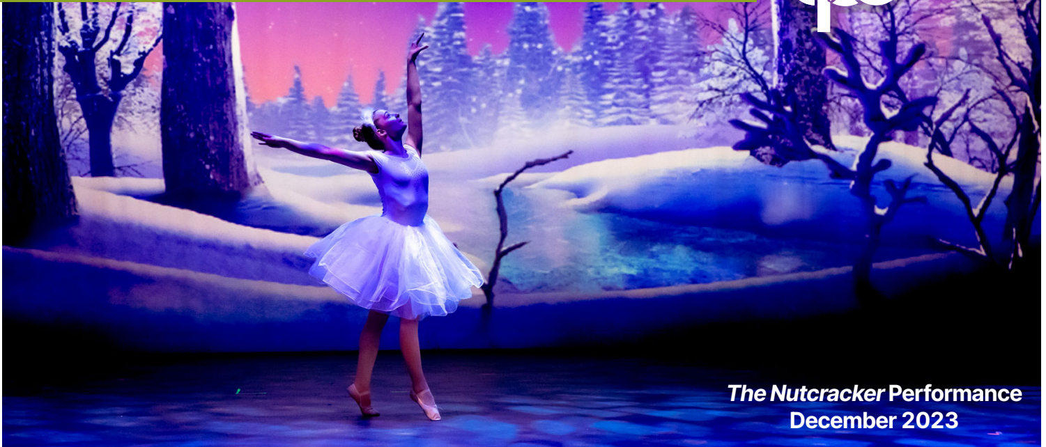
The Nutcracker Performance December 2023